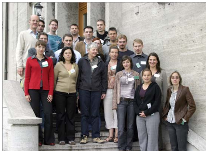
Participants of the real-time PCR workshop (September 2007 at the FLI)

-RNA from all serotypes of inactivated FMDV are in preparation